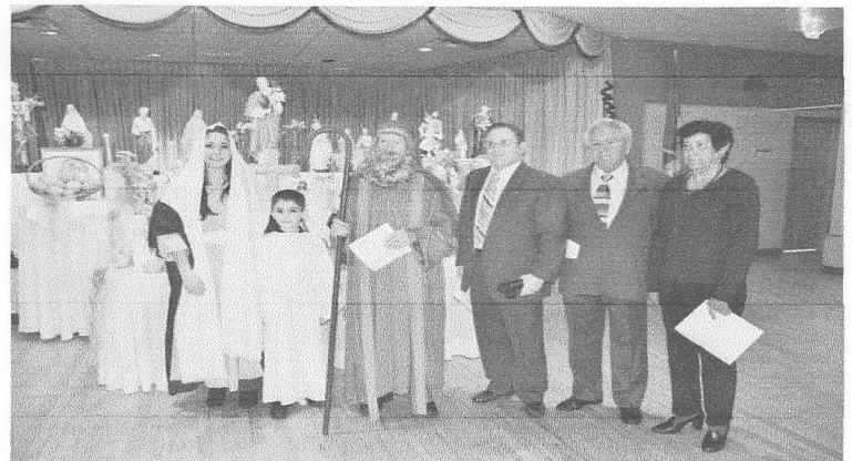
Pageant Performers above, volunteers below

NEWSLETTER CHANGES - You will note that this newsletter is combined for the months of April and May. We will also be sending out a newsletter for June, a combined September/October and combined November/December. So save the newsletter to make sure you have your dates for the general membership meetings and special events.