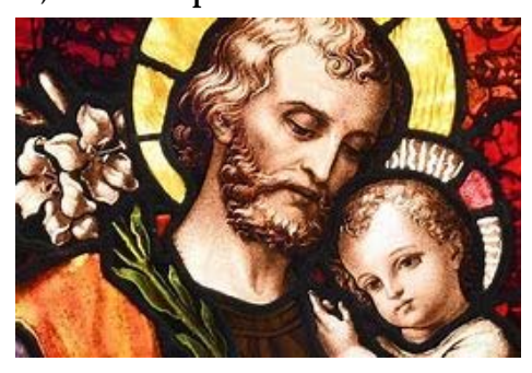
May St. Joseph Bless You