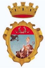
Comune di Bonero C.Basso, Molise, Italia