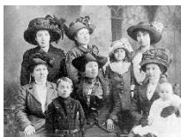
A FAMILY PHOTO OF OUR ANCESTORS