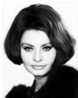
A FAMOUS ITALIAN LADY