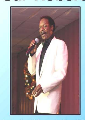
Singing the hits of the Platters

TICKETS $38.00 Includes Dinner & Show (Cash Bar) Beer $2.00 / Well Mix Drinks $3.00 DINNER @ 6:30 PM - SHOW @ 8:00 PM